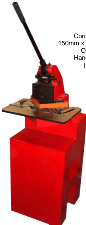
Corner Notcher 150mm x 150mm x 1.5mm On Stand* Hand Operated (CN150)

W. NEAL SERVICES LTD 29 Purdeys Way Purdeys Industrial Estate Rochford Essex SS4 1ND ENGLAND