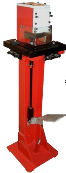
Corner Notcher 80mm x 80mm x 1.5mm Foot Operated (FN80)