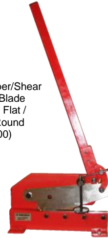
Lever Cropper/Shear 300mm Blade x 2.0mm Flat / 10mm Round (LC300)