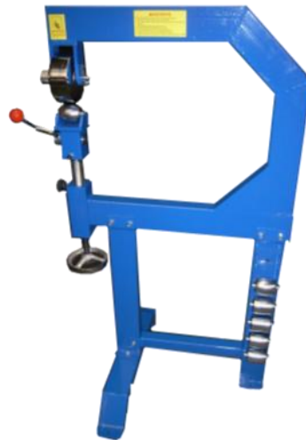
English Wheeling Machine 635mm. Quick Release Lever to raise & lower bottom wheel. Chrome Plated Wheels with Sealed Bearings. Hand Wheel. 100mm x 50mm Steel Box Section Frame. (EW635)

ENGLISH WHEELING MACHINES are used predominantly for the restoration of bodywork on cars, planes and motorcycles, though can be used for many other purposes. All machines come complete with a top roll and various lower wheels. Available in various throat depths to suit most requirements.