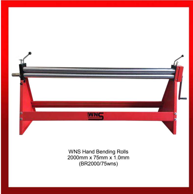
WNS Hand Bending Rolls 2000mm x 75mm x 1.0mm (BR2000/75wns)

W. NEAL SERVICES LTD 29 Purdeys Way Purdeys Industrial Estate Rochford Essex SS4 1ND ENGLAND