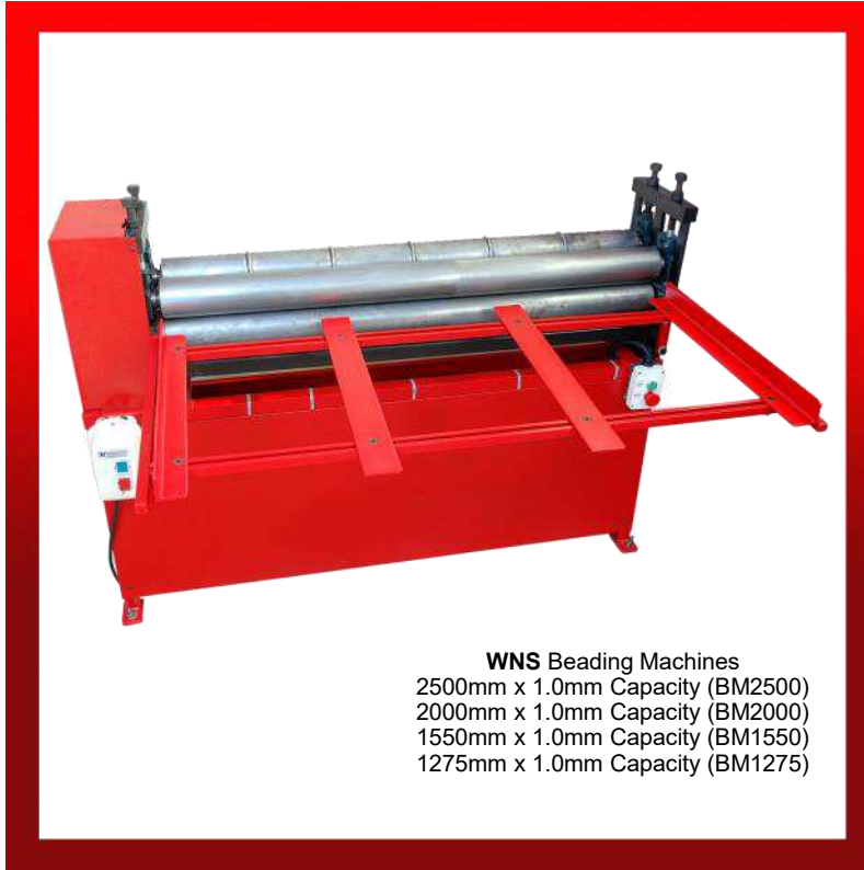
WNS Beading Machines 2500mm x 1.0mm Capacity (BM2500) 2000mm x 1.0mm Capacity (BM2000) 1550mm x 1.0mm Capacity (BM1550) 1275mm x 1.0mm Capacity (BM1275)

W. NEAL SERVICES LTD 29 Purdeys Way Purdeys Industrial Estate Rochford Essex SS4 1ND ENGLAND