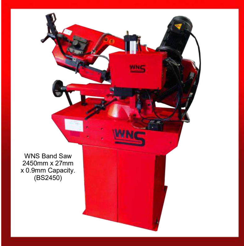
WNS Band Saw 2450mm x 27mm x 0.9mm Capacity. (BS2450)

W. NEAL SERVICES LTD 29 Purdeys Way Purdeys Industrial Estate Rochford Essex SS4 1ND ENGLAND