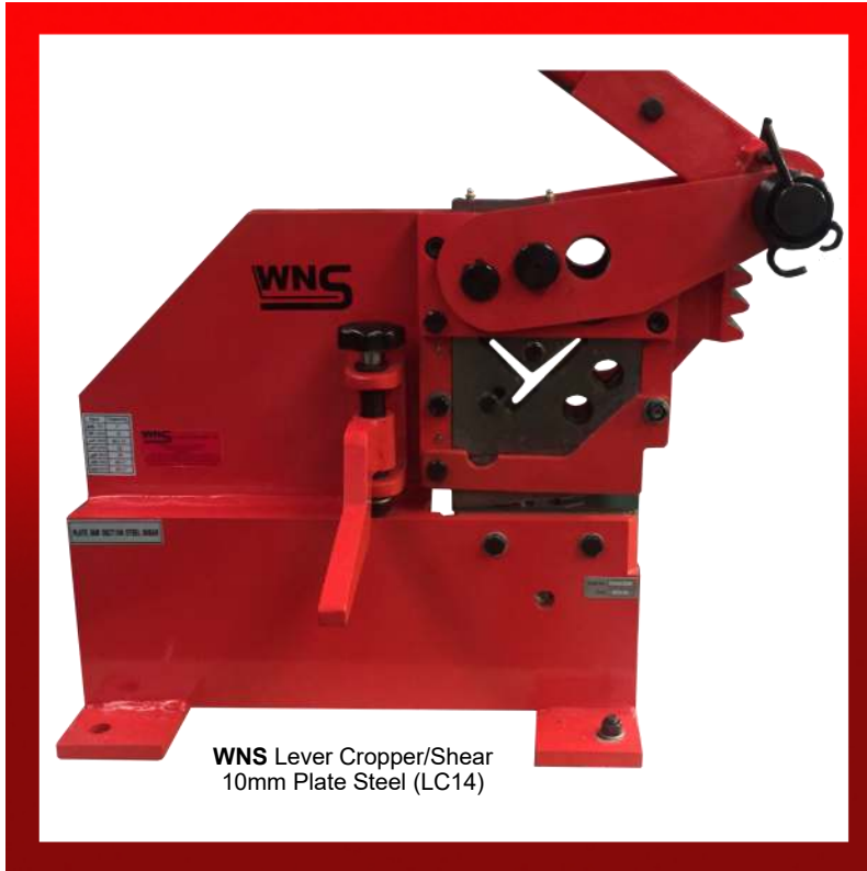
WNS Lever Cropper/Shear 10mm Plate Steel (LC14)

W. NEAL SERVICES LTD 29 Purdeys Way Purdeys Industrial Estate Rochford Essex SS4 1ND ENGLAND